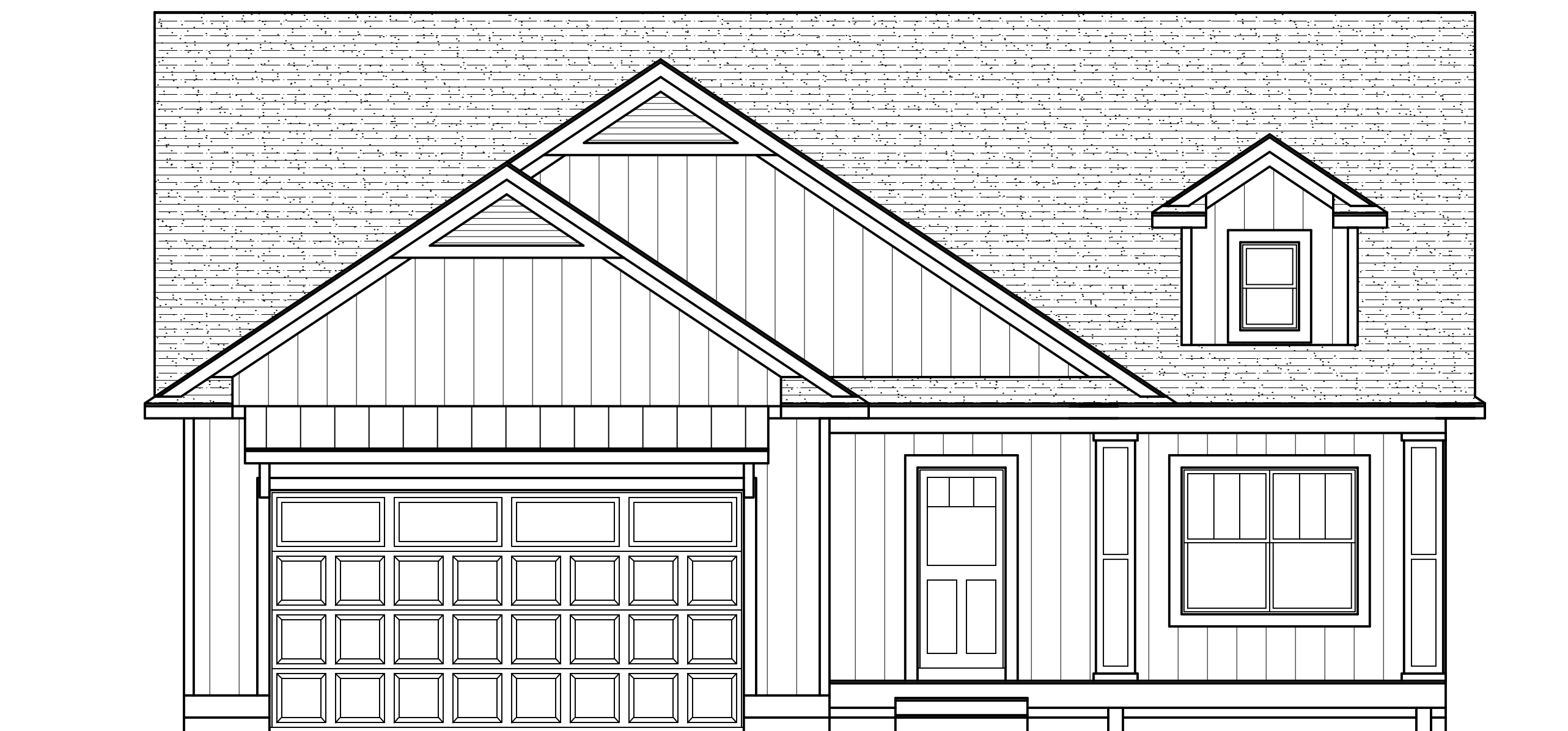
FRONT ELEVATION SCALE 1/4"=1'-0"